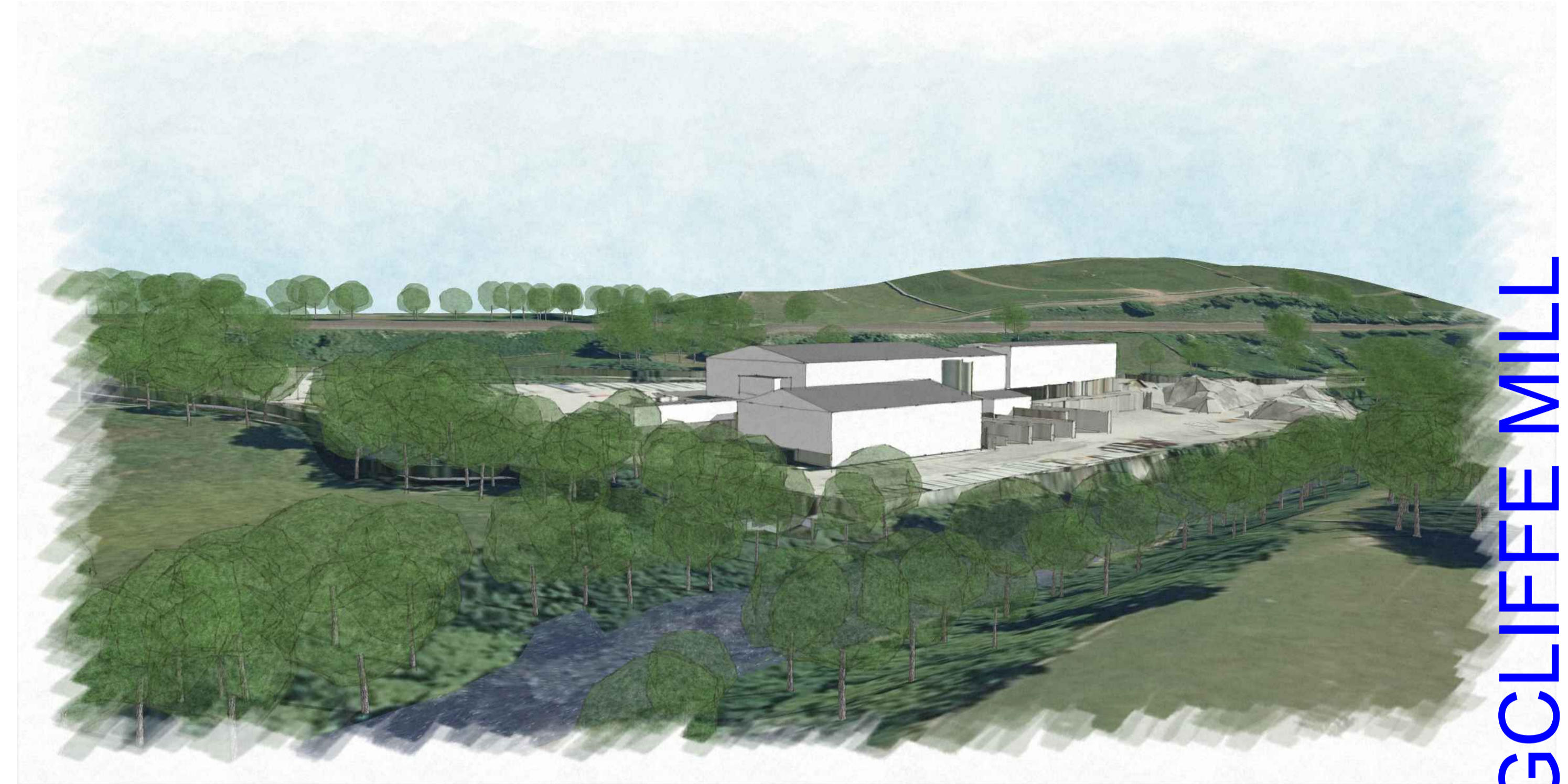
NORTH WEST FACING VIEW