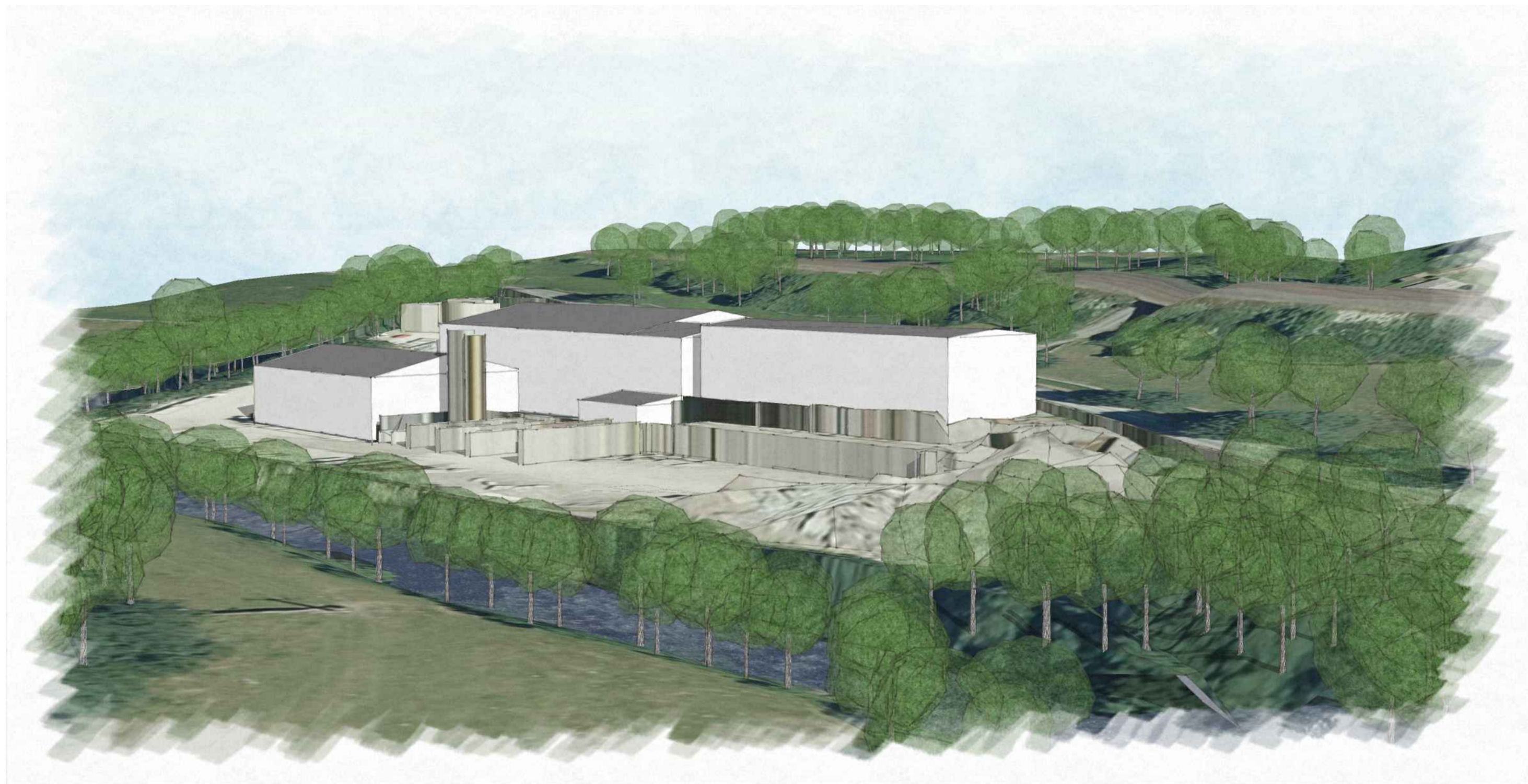
SOUTH WEST FACING VIEW