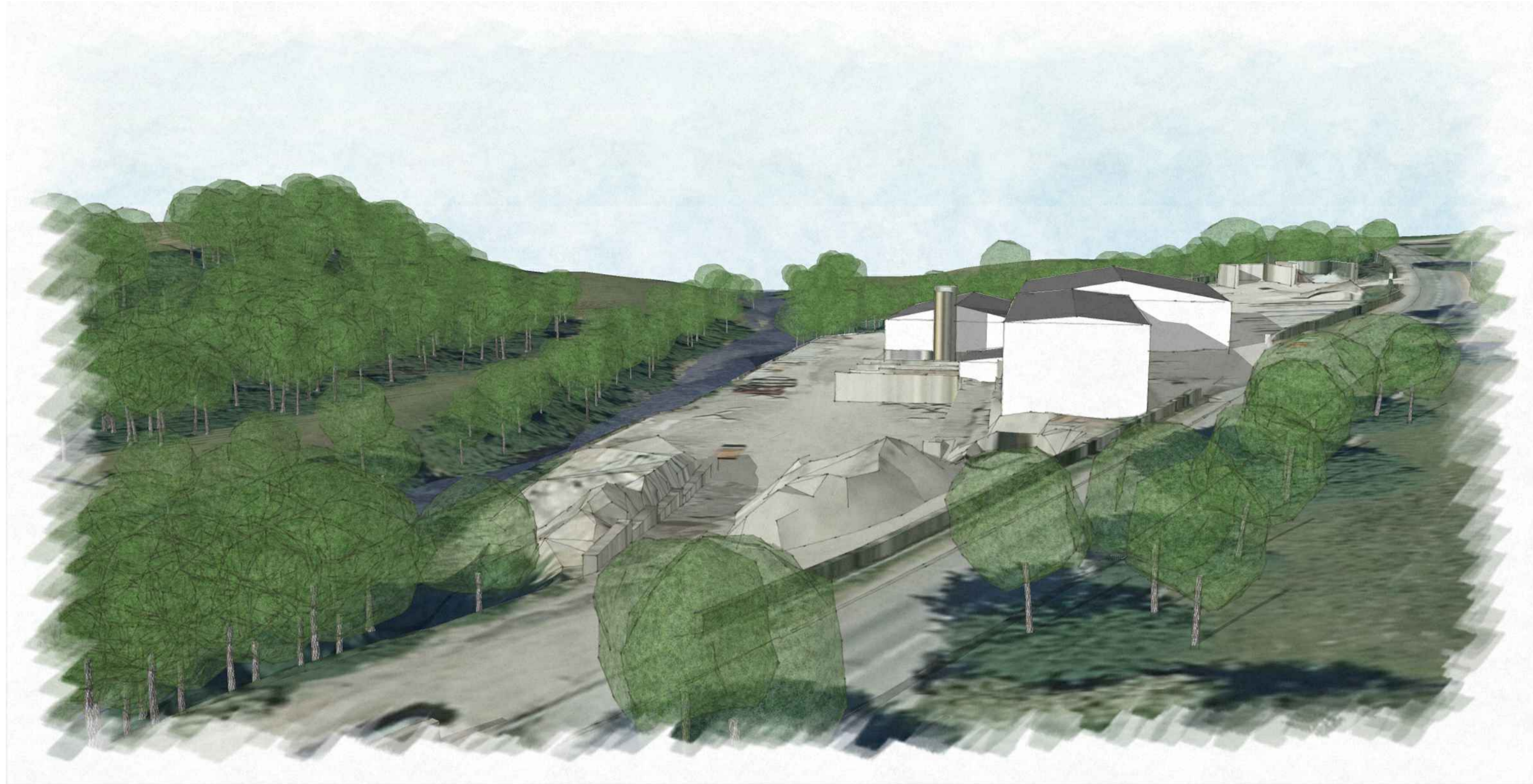
SOUTH EAST FACING VIEW