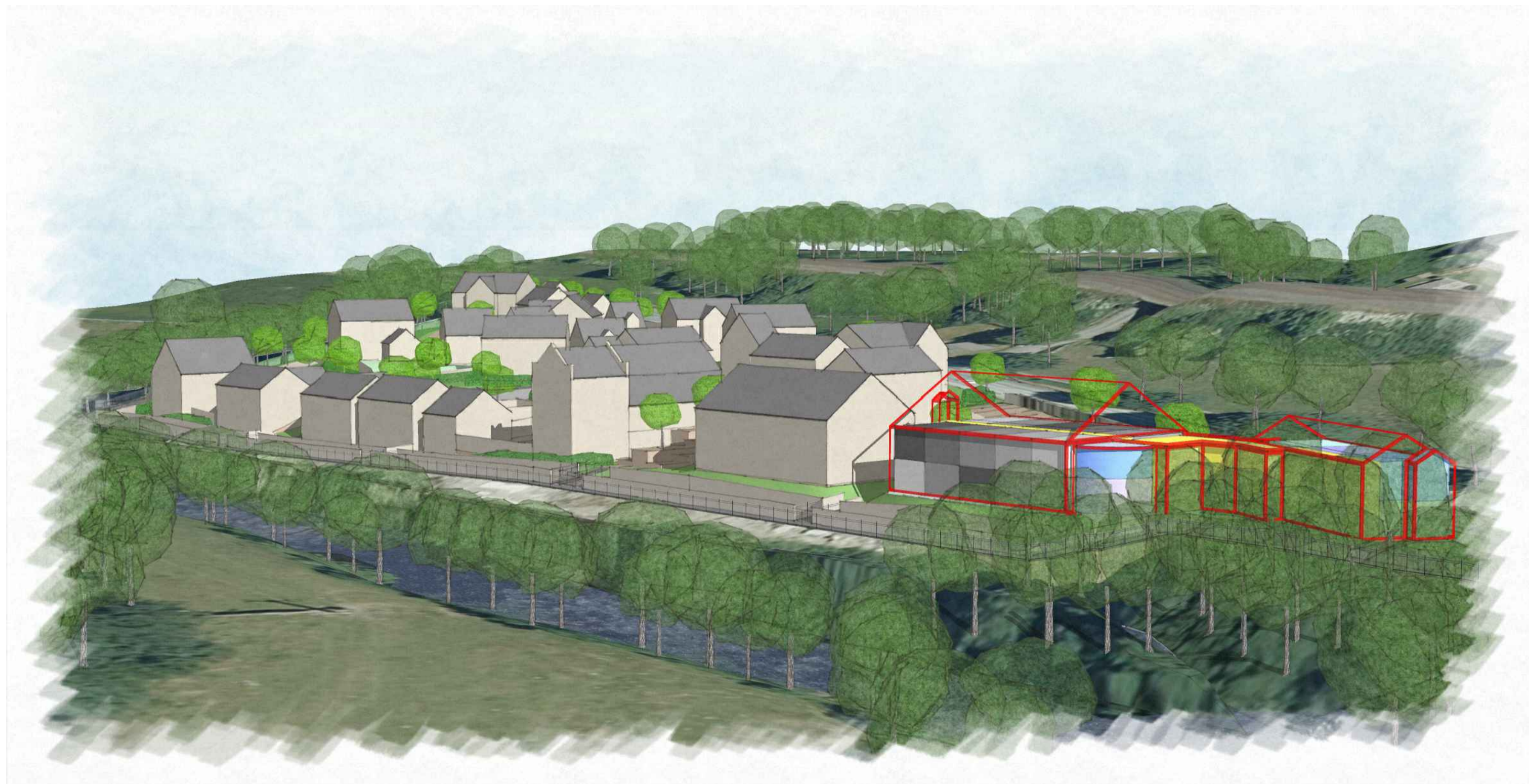
SOUTH WEST FACING VIEW