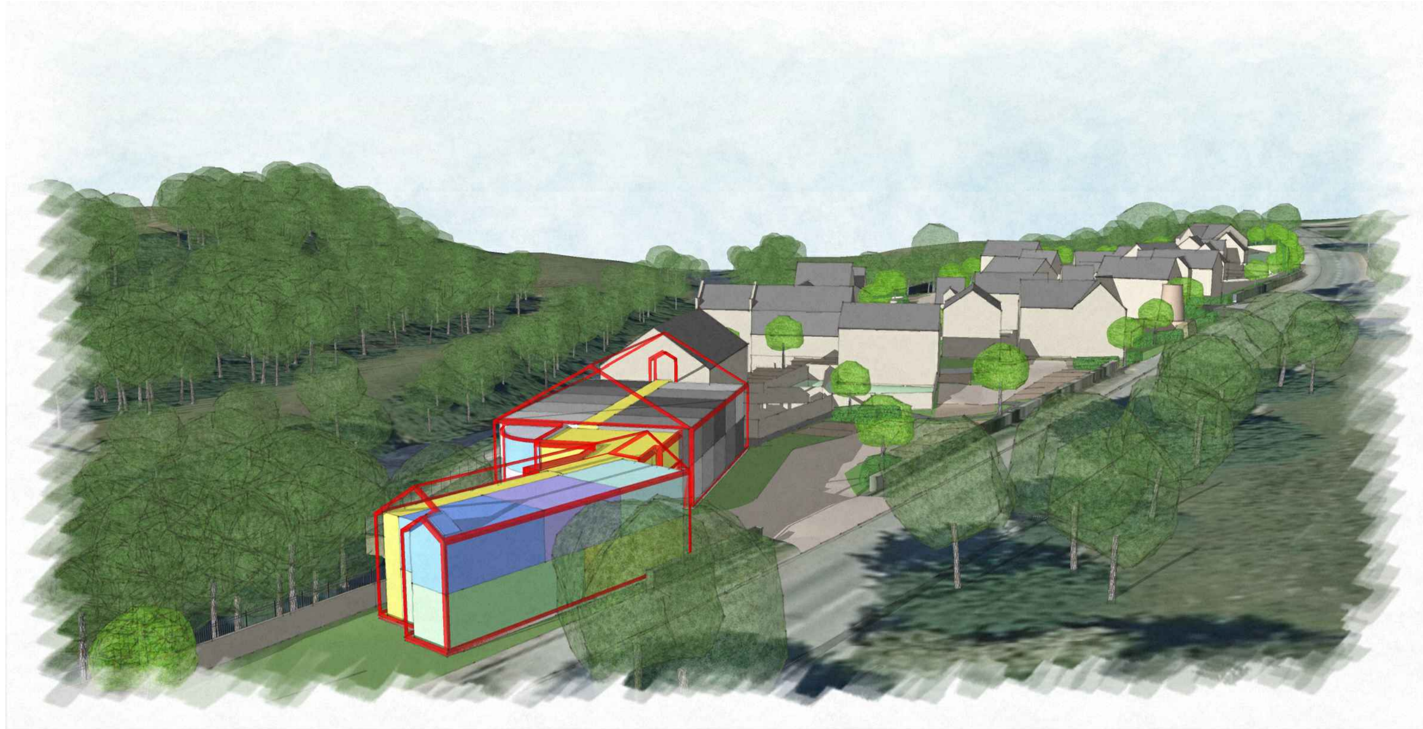
SOUTH EAST FACING VIEW