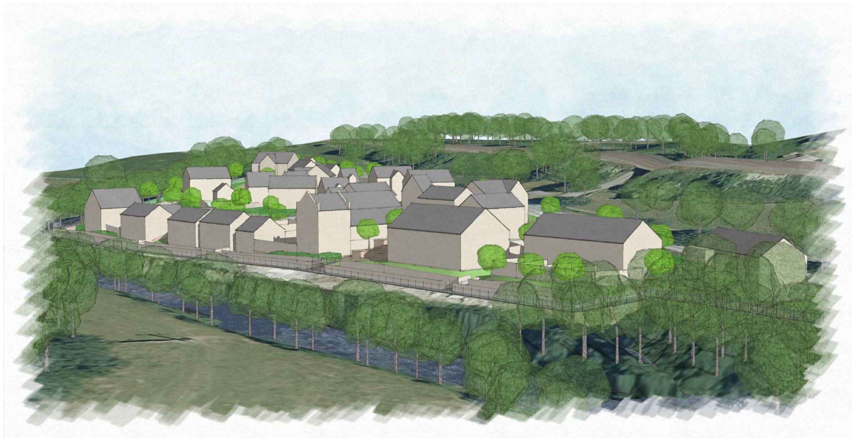
SOUTH WEST FACING VIEW