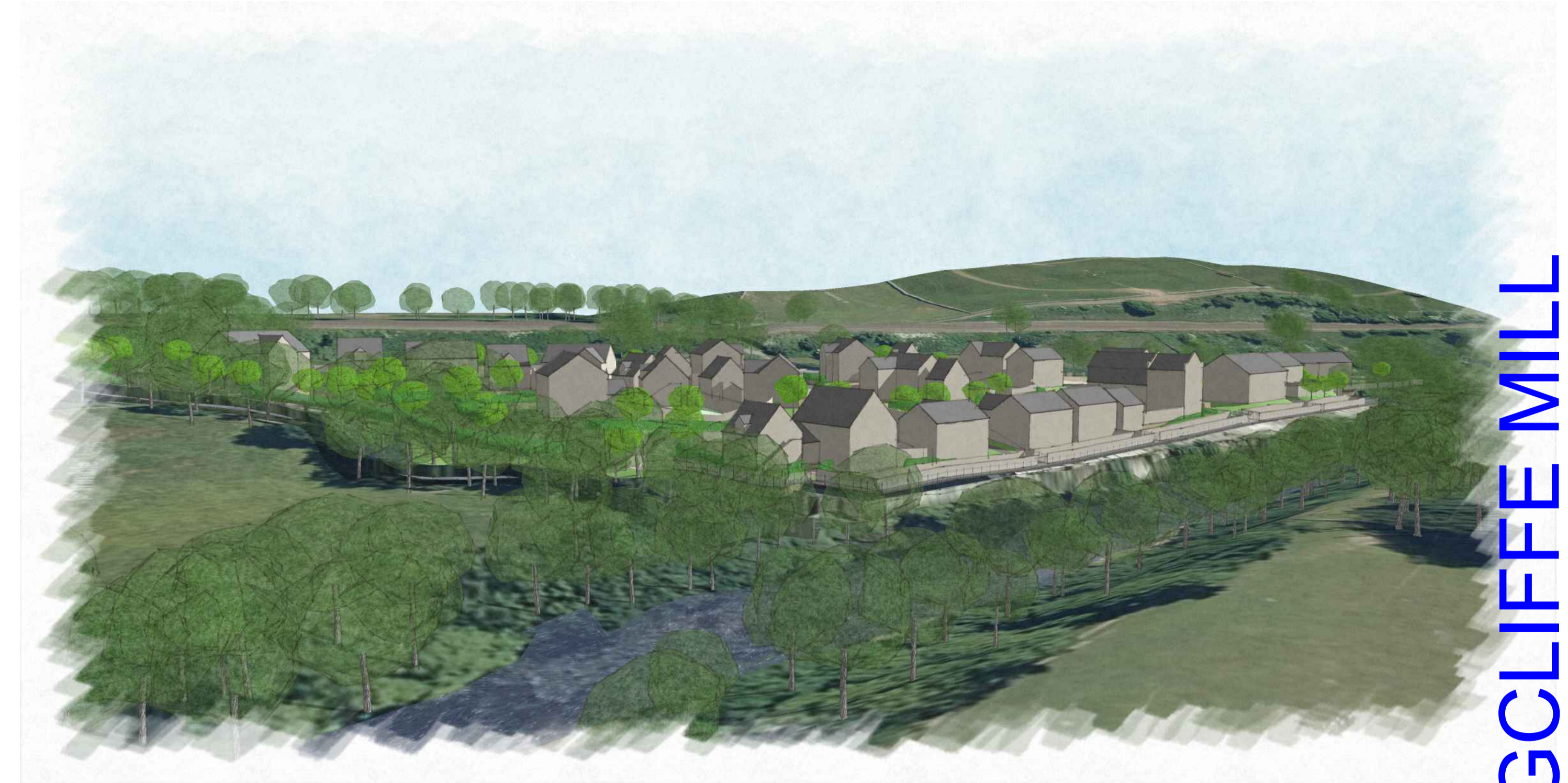
NORTH WEST FACING VIEW