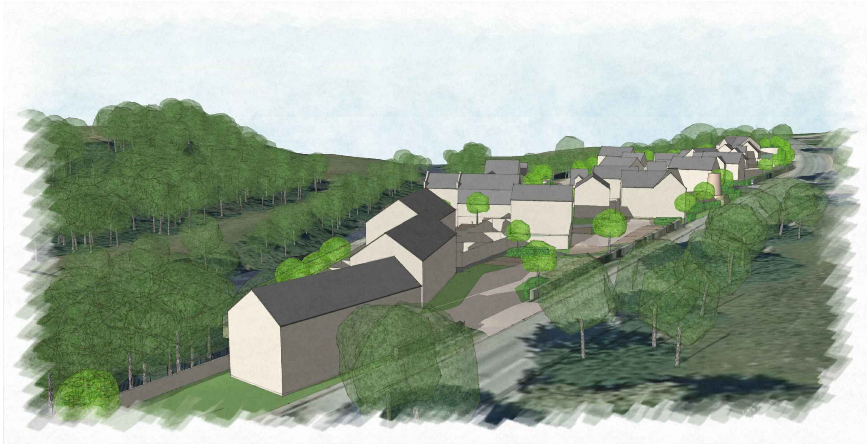
SOUTH EAST FACING VIEW